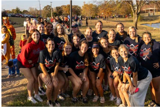
SSC softball team members were one of several campus groups that passed out candy along the Henderson Park walking trail.