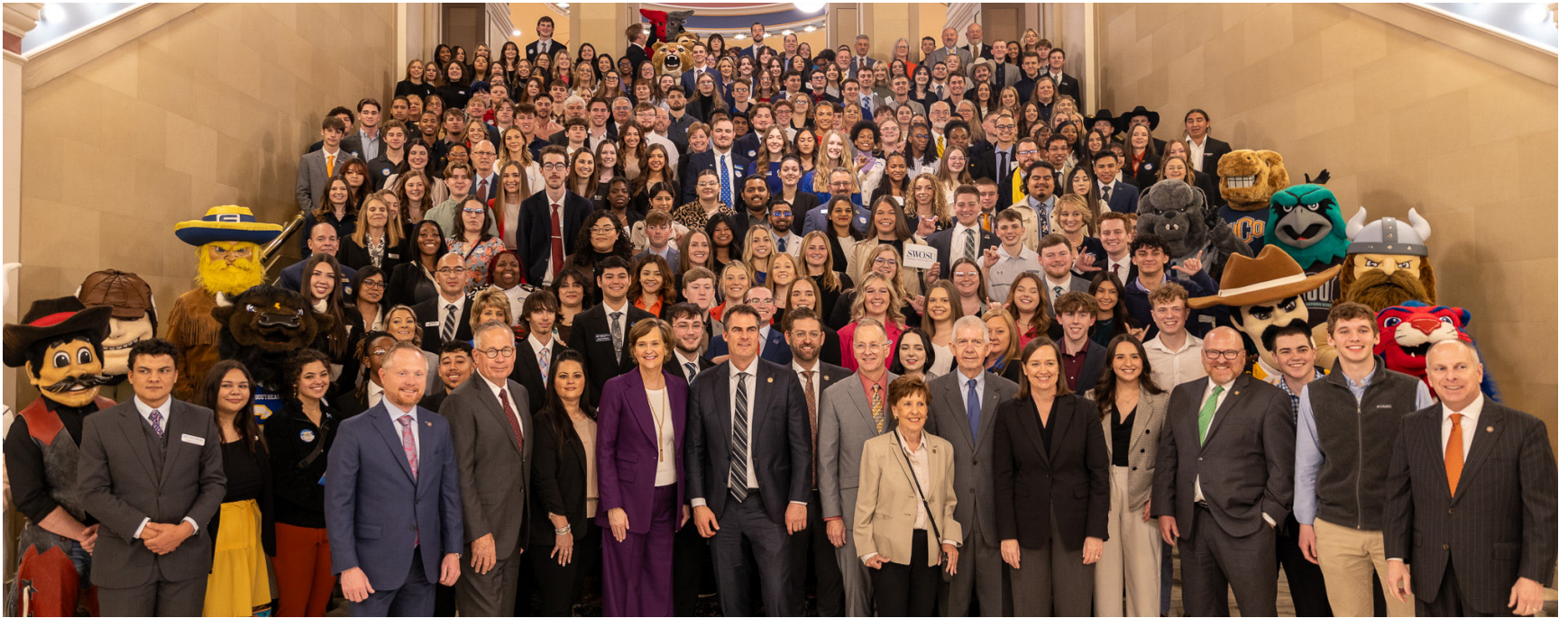
Seminole State College students, employees and community supporters joined colleges across the state at Higher Education Day at the State Capitol on Feb. 8.

A large delegation of campus and community leaders representing Seminole State College attended Higher Education Day at the Capitol in Oklahoma City Thursday, Feb. 8. The event, sponsored by the Oklahoma State Regents for Higher Education (OSRHE), is held annually to demonstrate the value and importance of higher education in the state.