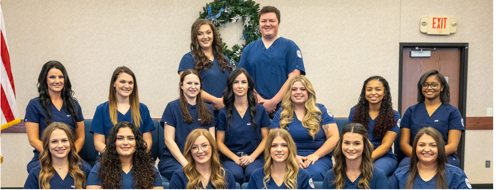
December graduates of the Seminole State College nursing program achieved a 100 percent pass rate on their NCLEX exams.

December 2023 graduates of the Seminole State College nursing program recently achieved a 100 percent pass rate on their National Council Licensure Examination (NCLEX).