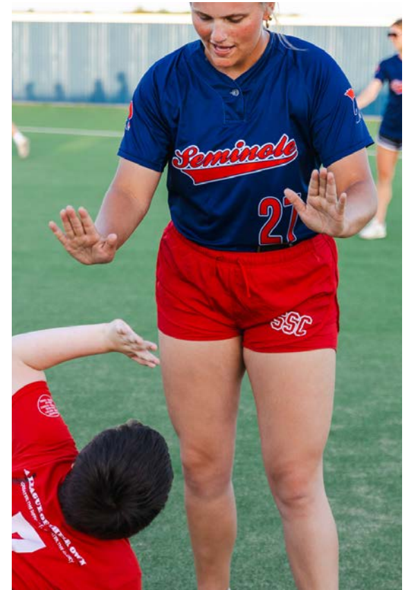
Members of the SSC women's soccer and softball teams, alongside SSC employees, volunteered at A League of Their Own's game on April 27 at the Avedis Foundation Adaptive Field. The co-ed softball league provides individuals with cognitive or physical disabilities the opportunity to play baseball.