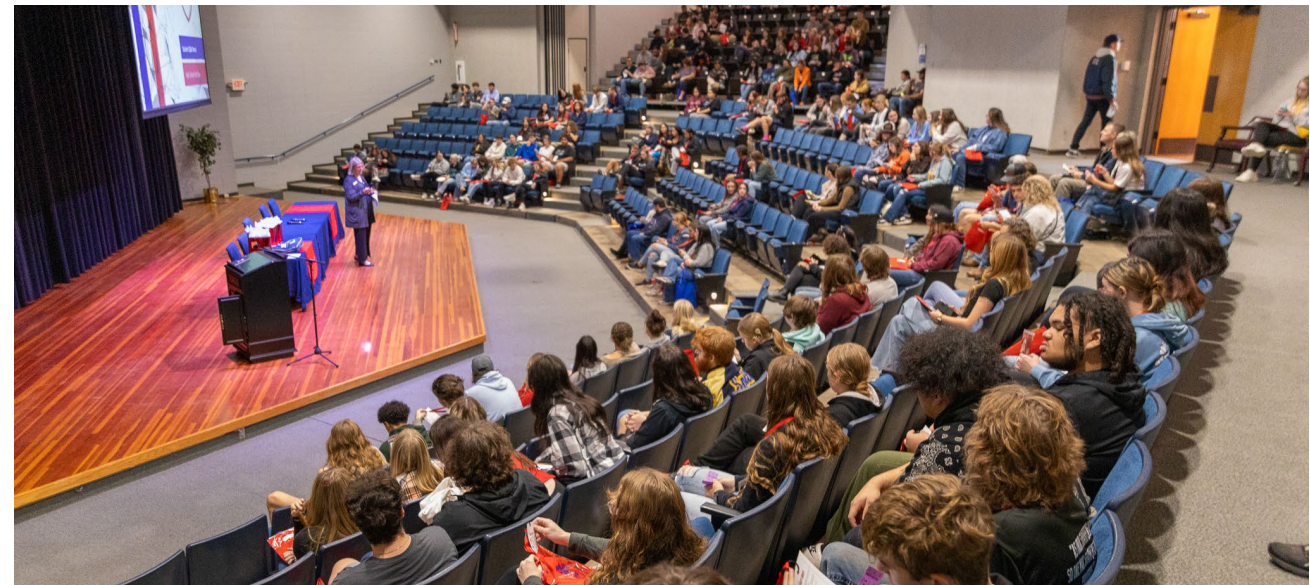
High School Visit Day – November 12 Close to 200 in Attendance Representing 22 Schools