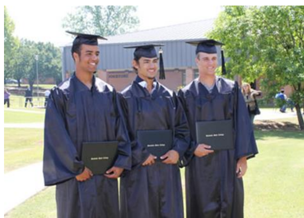
2016 Seminole State College Commencement.

Additional information concerning the College's long-term liabilities can be found in the Notes to the financial statements.