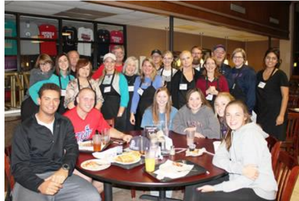
SSC annual finals eve student breakfast

and Scholarships & Fellowships of $179,621. With the efforts to reduce energy consumed in our facilities SSC also had a 16.9% reduction in utilities.