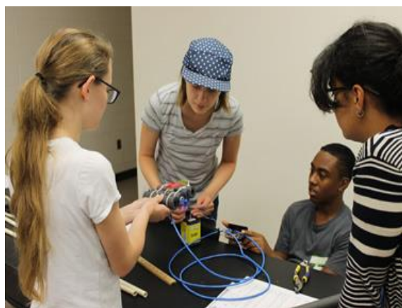
Peek Into Engineering (PIE) Summer Academy at SSC

The following table summarizes the College's revenues, expenses and changes in net position, for the years ended June 30: