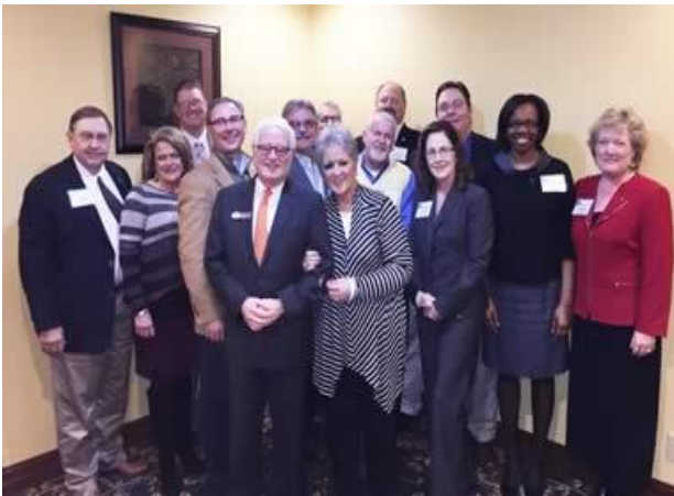
Seminole State College supporters attend the Southeast Oklahoma Legislative Briefing

The College will make every effort not to reduce any programs or services and will continue to monitor the state and national economic conditions as part of our financial decision making process. The College will strive to develop scenarios to reduce costs and increase operating revenues to protect critical academic programming, while being sensitive to our students. Efforts continue to improve external fund development as a resource.