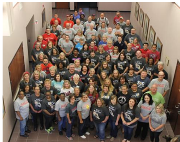
Seminole State College 2016 In-service.

In the fiscal year 2016, an addition of a $2,420,096 investment in capital assets and an overall net increase in restricted and unrestricted net position of $621,422, caused a reduction of the negative net position to ($9,875,116). In 2015 the net position was restated as ($12,916,634).