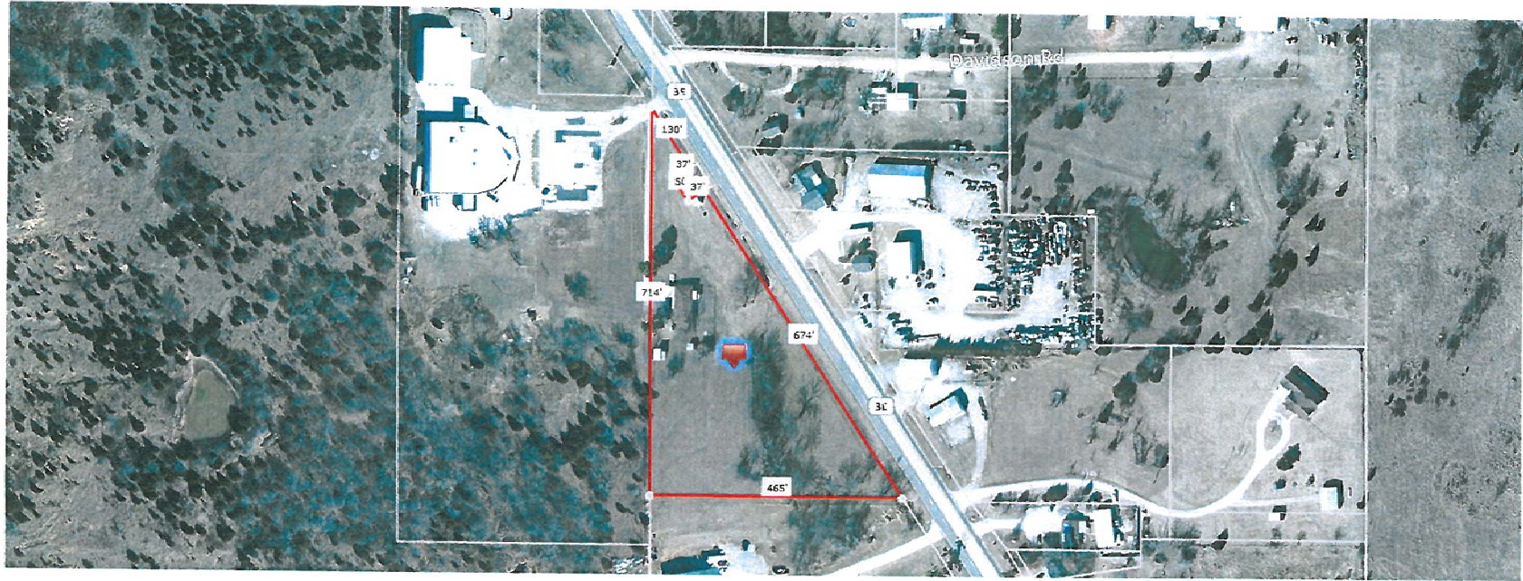
Schroeder Property – North of Campus