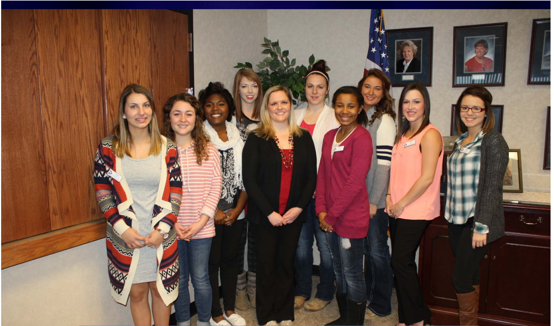
Women's Leadership Luncheon February 4th