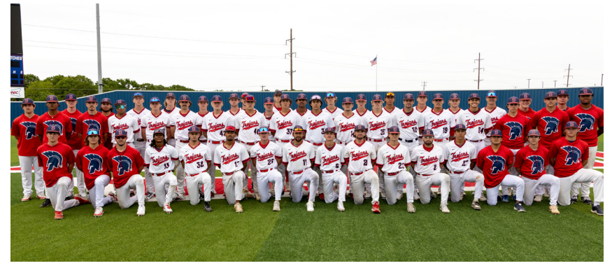
The SSC baseball team, holding the No. 1 seed in the Region II bracket, will play the winner of Game One (Connors State vs. Rose State) on Thursday, May 8, at 7 p.m. at the Brian Crawford Memorial Sports Complex in Seminole.

Division I Baseball Tournament at the Brian Crawford Memorial Sports Complex in Seminole, Oklahoma, May 8-11. This marks the second consecutive year SSC has hosted the tournament.