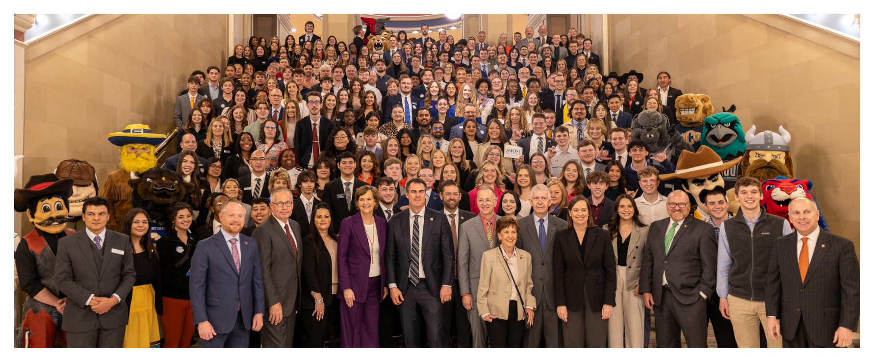
Seminole State College students, employees and community supporters joined colleges across the state at Higher Education Day at the State Capitol on Feb. 8.

A large delegation of campus and community leaders representing Seminole State College attended Higher Education Day at the Capitol in Oklahoma City Thursday, Feb. 8. The event, sponsored by the Oklahoma State Regents for Higher Education (OSRHE), is held annually to demonstrate the value and importance of higher education in the state.