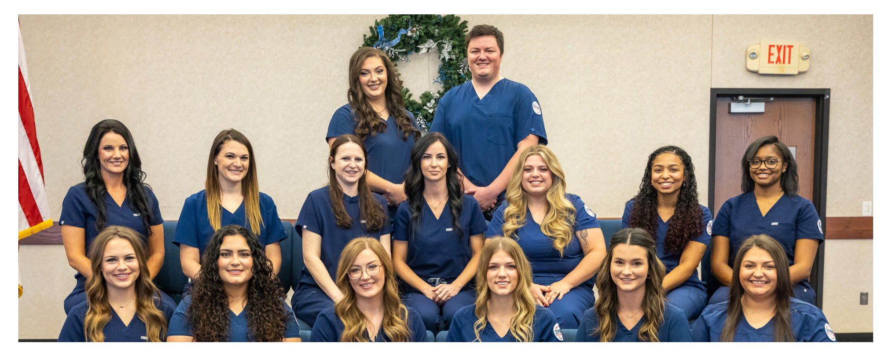
December graduates of the Seminole State College nursing program achieved a 100 percent pass rate on their NCLEX exams.

December 2023 graduates of the Seminole State College nursing program recently achieved a 100 percent pass rate on their National Council Licensure Examination (NCLEX).