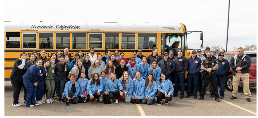
SSC nursing students participated in a disaster response training on Feb. 28 at the softball field's parking lot. The students were joined by local and state agencies to learn how to assess, coordinate and treat victims.

Seminole State College nursing students got a hands-on experience in disaster response on Feb. 28 at the softball field parking lot on campus. Nursing students worked alongside local agencies to respond to a simulated school bus wreck.