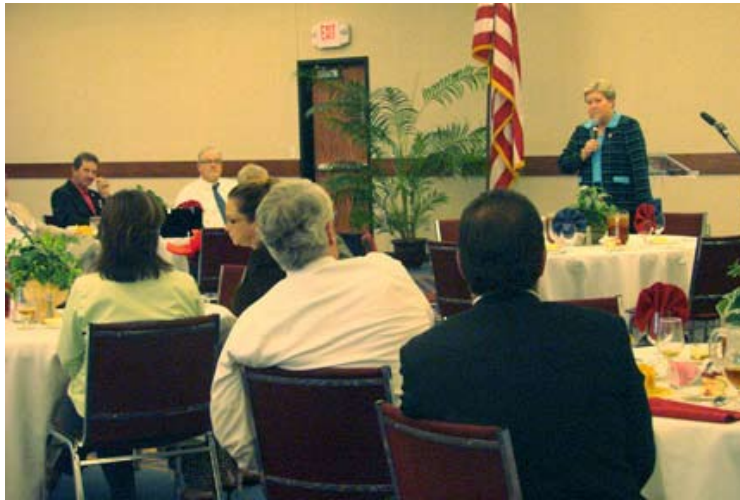
Lt. Governor Jari Askins speaking at the “New World – New Marketing – New Money!” program luncheon sponsored by the Oklahoma Small Business Advocacy Committee and hosted by the Oklahoma Department of Commerce and Seminole State College.

“The importance of small business forum meetings is two-fold. We want to make businesses aware of the resources available to them and