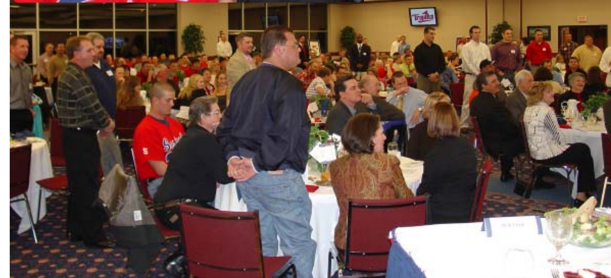
Former Trojan baseball players stand as they are introduced and recognized at the Trojan Diamond Dinner (right).