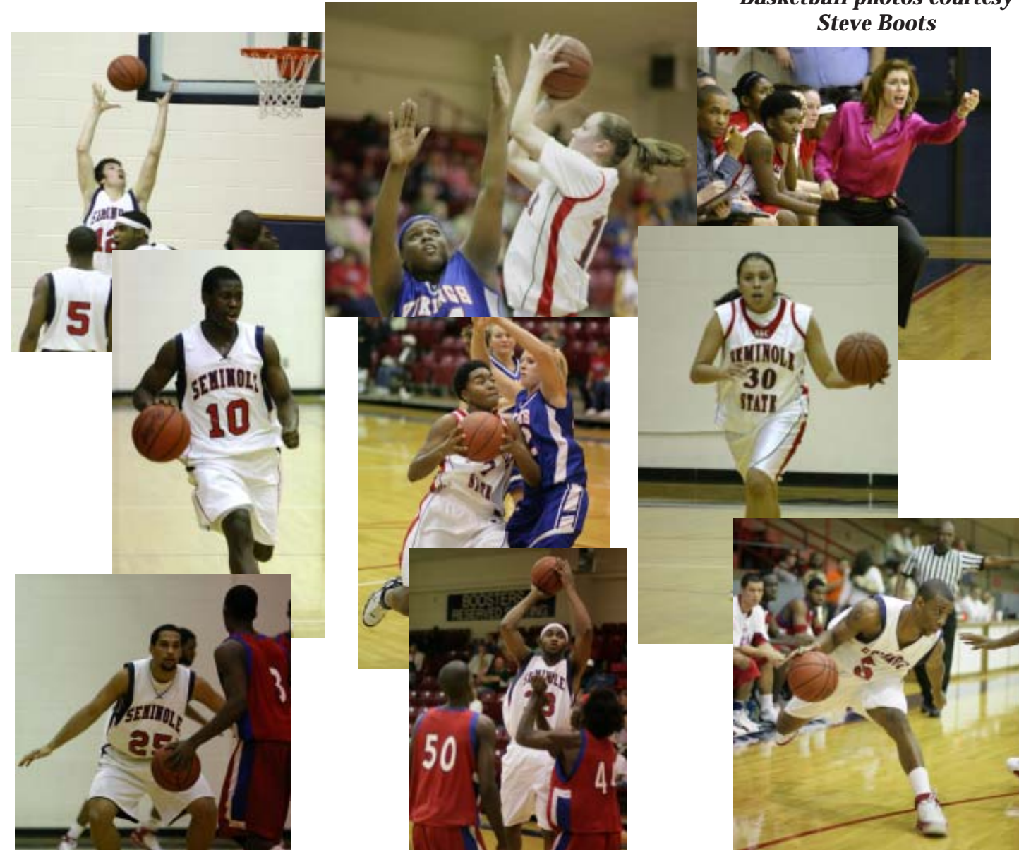
Basketball photos