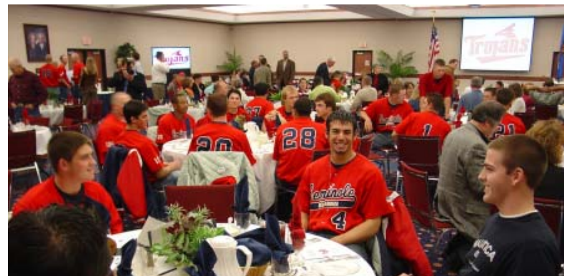
Trojan baseball players and nearly 300 SSC supporters gathered together for an evening of memories and fellowship as they kicked off the season at the Trojan Diamond Dinner (left).

The Trojan Diamond Dinner was the official kick-off for the 2006 baseball season. The Trojans open their season at home on Saturday, Feb. 11 with a double-header against North Central Texas and Laredo, Texas. The games begin at 1 p.m.