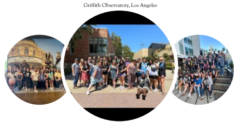
SSC Upward Bound Bridge students finished their summer camp with a trip to Los Angeles and Hollywood, California.